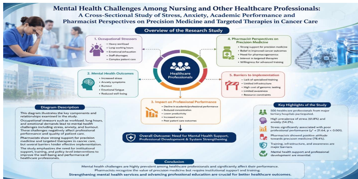
Figure I. Conceptual framework illustrating the relationship between occupational stressors, mental health outcomes, professional performance, and pharmacist perspectives on precision medicine

Figure I represents the conceptual model of the study and the connection between occupational stressors, mental health consequences, professional performance, and perspectives of pharmacists concerning the implementation of precision medicine in the cancer care setting. From the diagram, it can be seen that employees of tertiary healthcare institutions are facing a variety of occupational stressors such as heavy workloads, long working hours, emotional exhaustion, understaffing, and increasing responsibilities to care for patients.